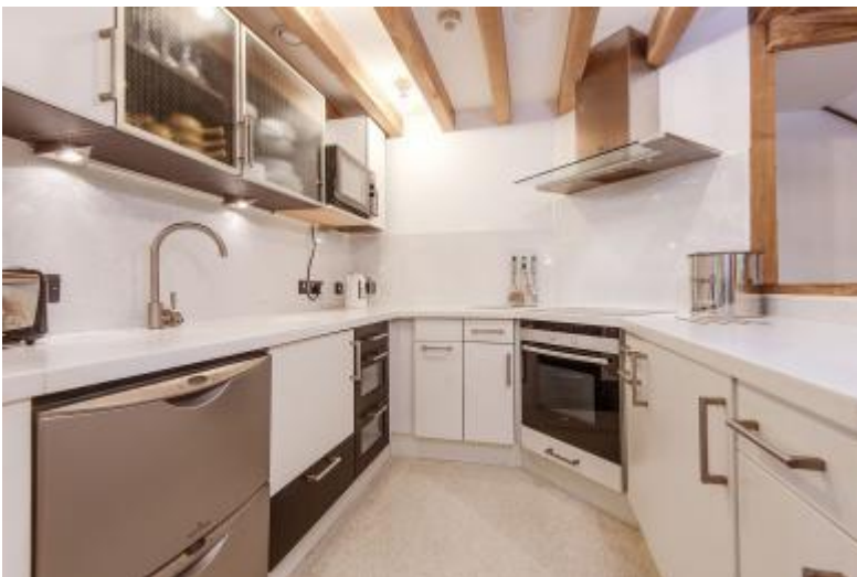
Kitchen with Altro non-slip floor, accessible contrasting handles on kitchen units