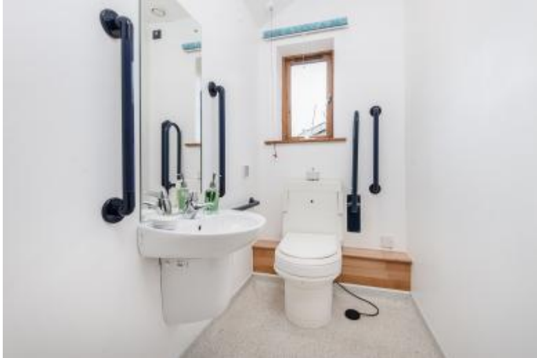
Downstairs cloakroom with Close-O-Matt shower toilet, lever action basin , emergency red pull cord, coin turn locks on door.