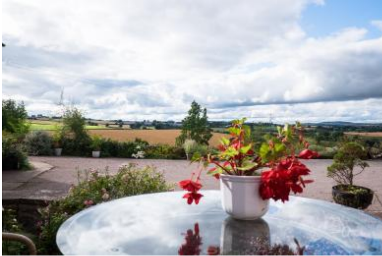
Valley View , front patio, views over the Garron Valley