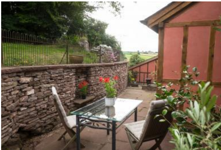
Rear patio , one step over the threshold from the cottage.