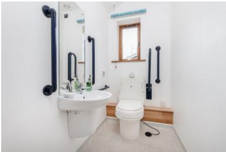
Clos-o-Matt shower toilet, Altro non-slip flooring, , contrasting safety rails, emergency lighting and red pull cord.