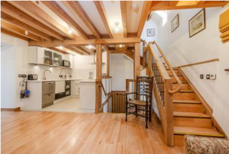
The main living room, contrasting timber and walls, with blue electrical sockets .