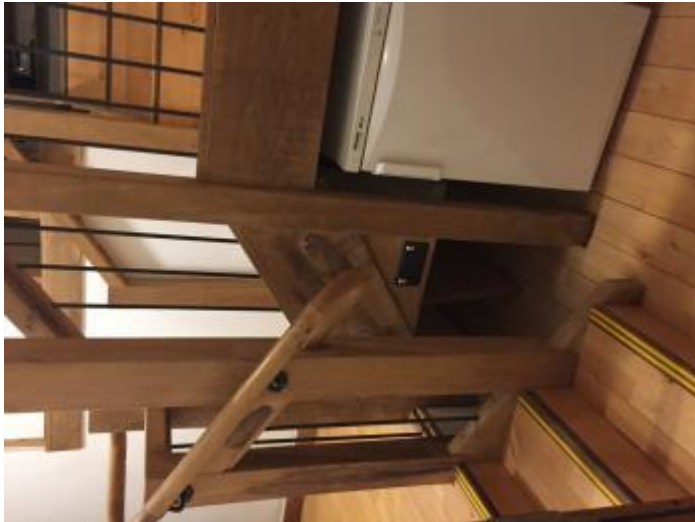
Lower passageway, access to Bramble's Barn and the freezer unit