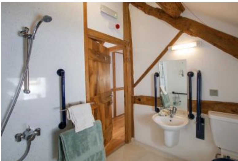
First floor cloak-room, with Close-O-Matt shower toilet, and contrasting fixtures. front and left transfer, red pull cord.