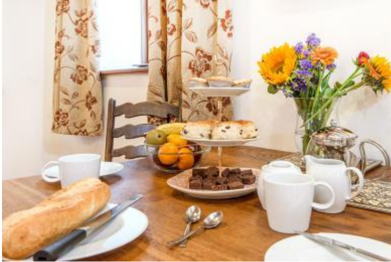
Dining area, ready for breakfast. dining chair with arms .